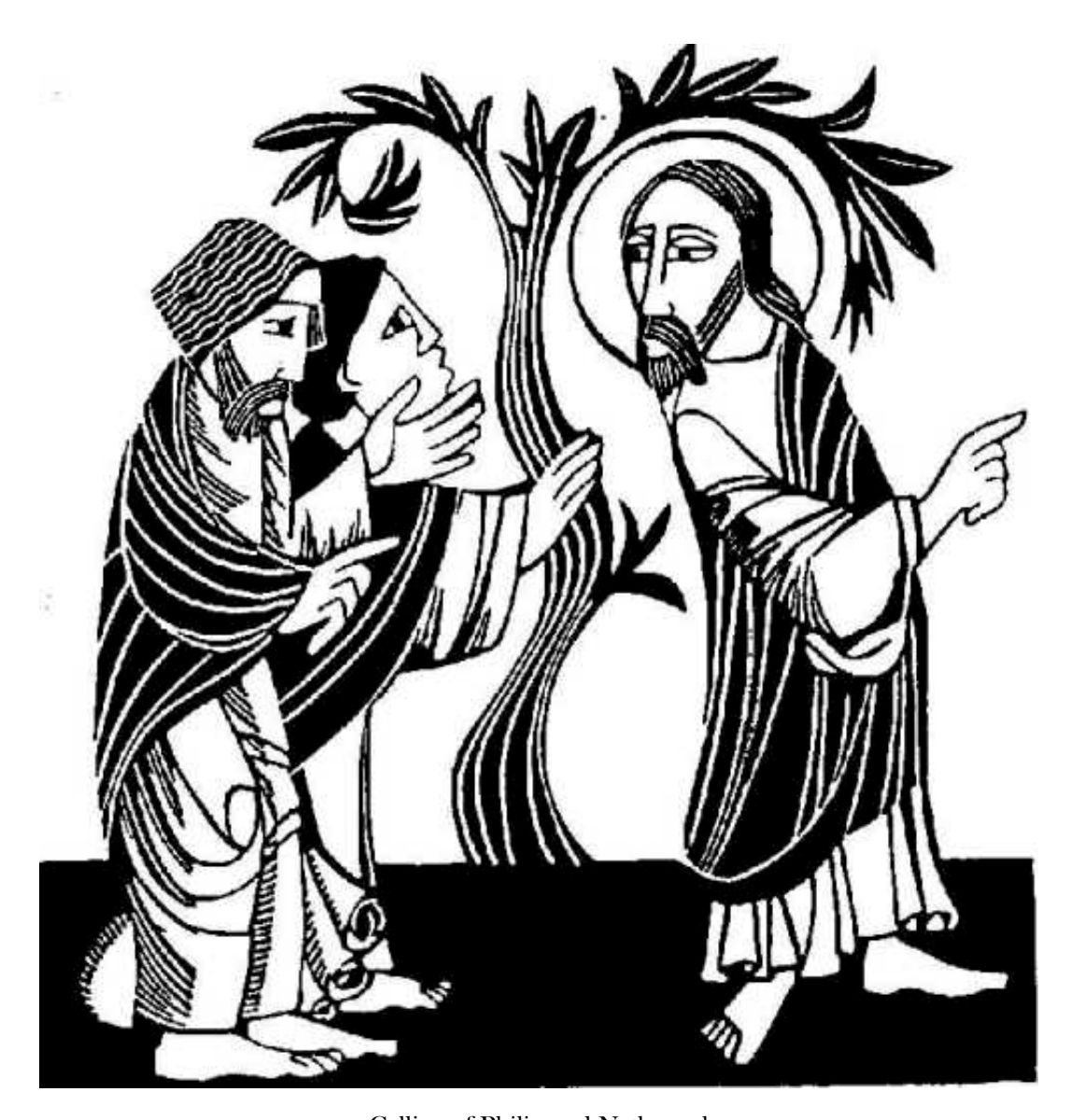
Calling of Philip and Nathanael