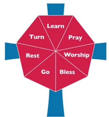
THE WAY OF LOVE Practices for Jesus-Centered Life

Learn more about the Way of Love at episcopalchurch.org/wayoflove . You can find suggestions on getting started and going deeper with Going at iam.ec/explore .