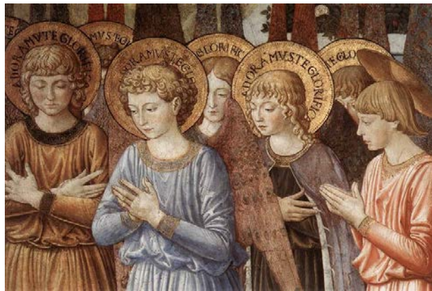
Angels Worshipping Benozzo Gozzoli (1459 – 1461)