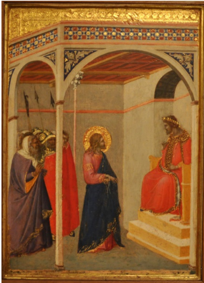
Christ before Pilate Pietro Lorenzetti (ca. 1280 – 1348)