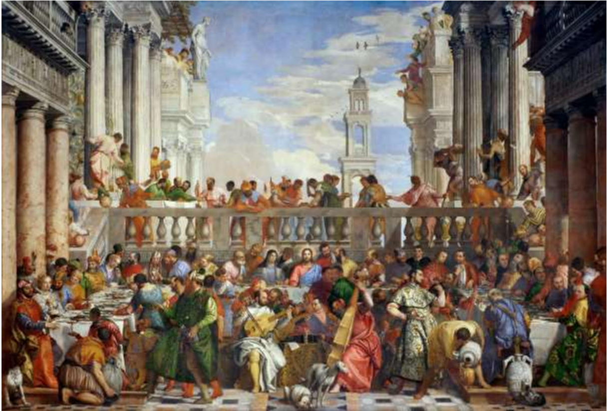
Marriage at Cana Paolo Veronese (1528 - 1588)