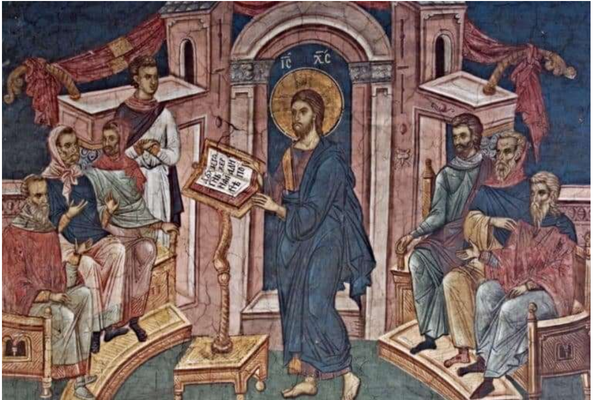
Jesus in the Synagogue at Nazareth