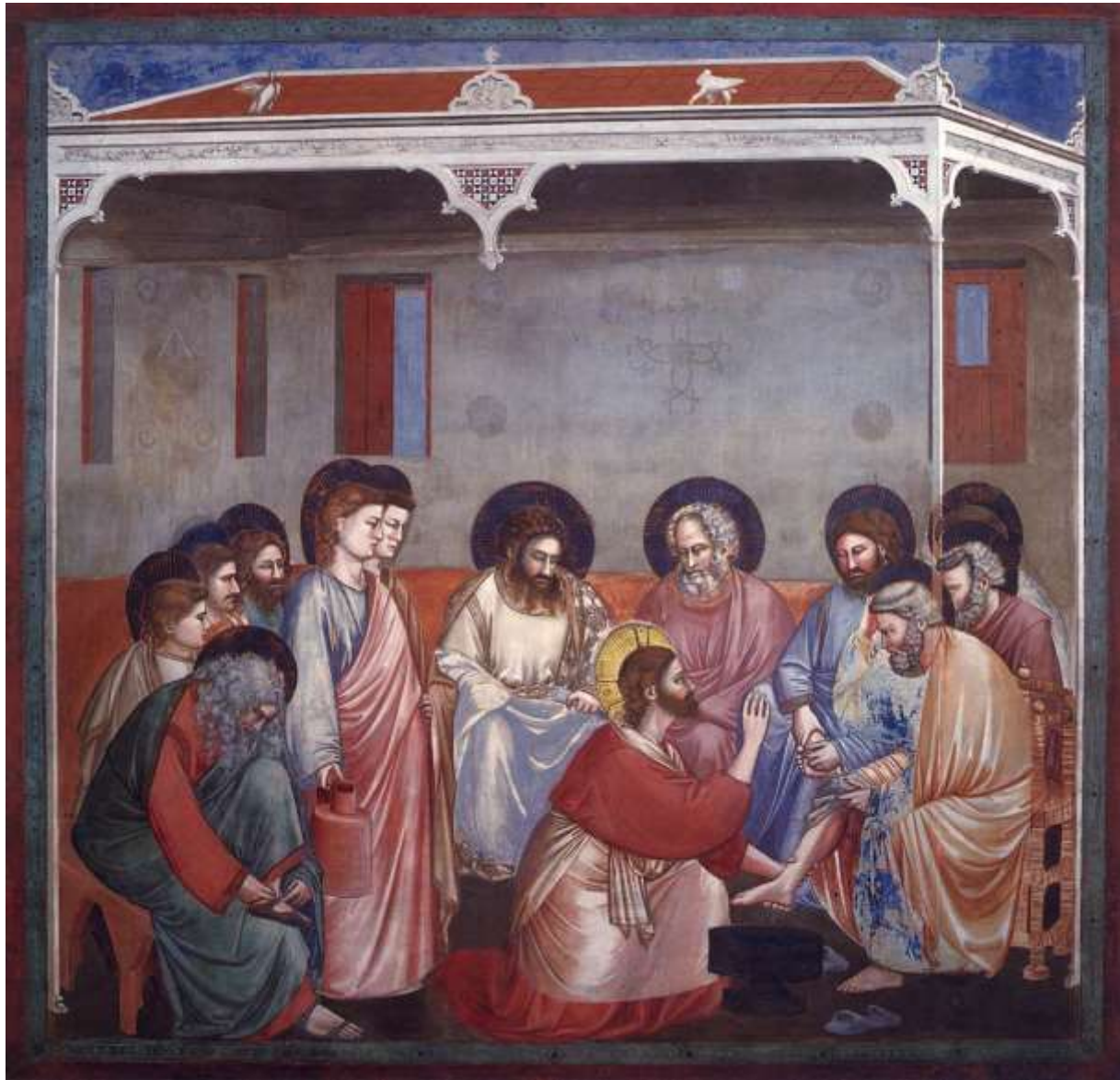
The Washing of the Feet Giotto di Bondone (1267-1337)