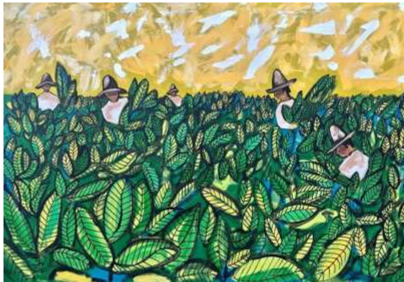
Reap what you sow Ernesto Ybarra