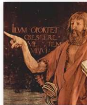
John the Baptist from Matthias Grünewald's Isenheim Altarpiece. The text, referring to Jesus, reads: "He must become greater, I must become less."

Blessed be the Lord God of Israel, for he has looked favorably on his people and redeemed them. He has raised up a mighty savior for us in the house of his servant David, as he spoke through the mouth of his holy prophets from of old, that we would be saved from our enemies and from the hand of all who hate us. Thus he has shown the mercy promised to our ancestors, and has remembered his holy covenant, the oath that he swore to our ancestor Abraham, to grant us that we, being rescued from the hands of our enemies, might serve him without fear, in holiness and righteousness before him all our days. And you, child, will be called the prophet of the Most High; for you will go before the Lord to prepare his ways, to give knowledge of salvation to his people by the forgiveness of their sins. By the tender mercy of our God, the dawn from on high will break upon us, to give light to those who sit in darkness and in the shadow of death, to guide our feet into the way of peace' (Luke 1:67-79).