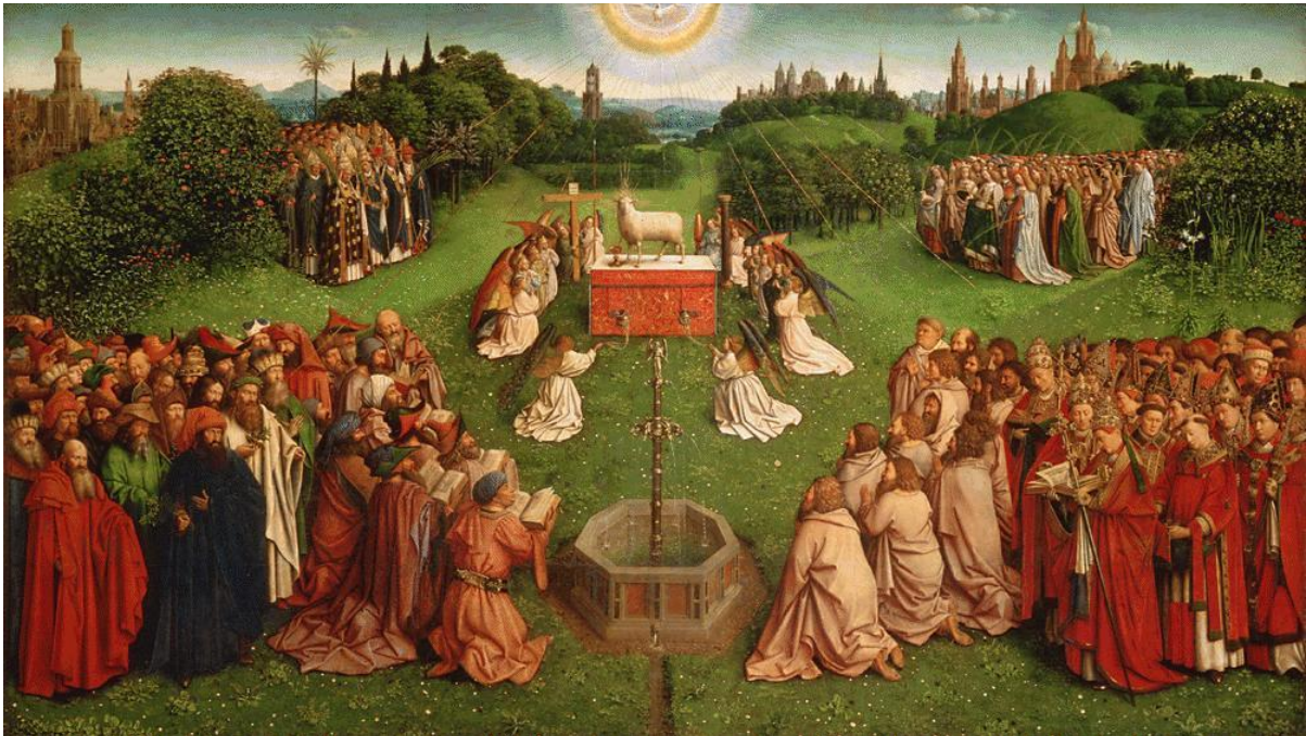
Detail from the Ghent Altarpiece – Hubert and Jan van Eyck (c.1432)

Already in the mind of God that city riseth fair; lo how its splendor challenges the souls that greatly dare, yea, bids us seize the whole of life and build its glory there.