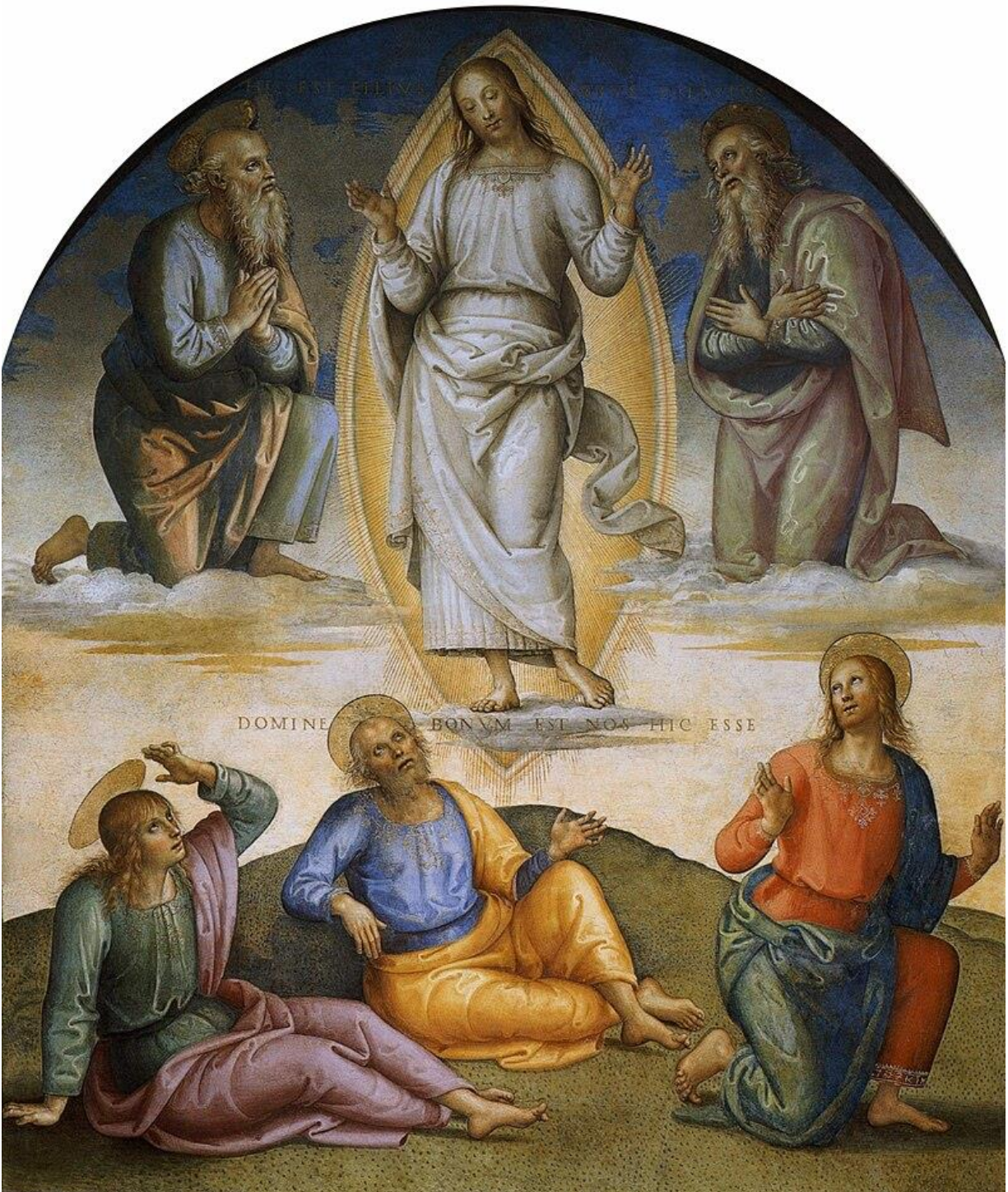
Pietro Perugino: Collegio del Cambio (Trasfigurazione) ca. 1500