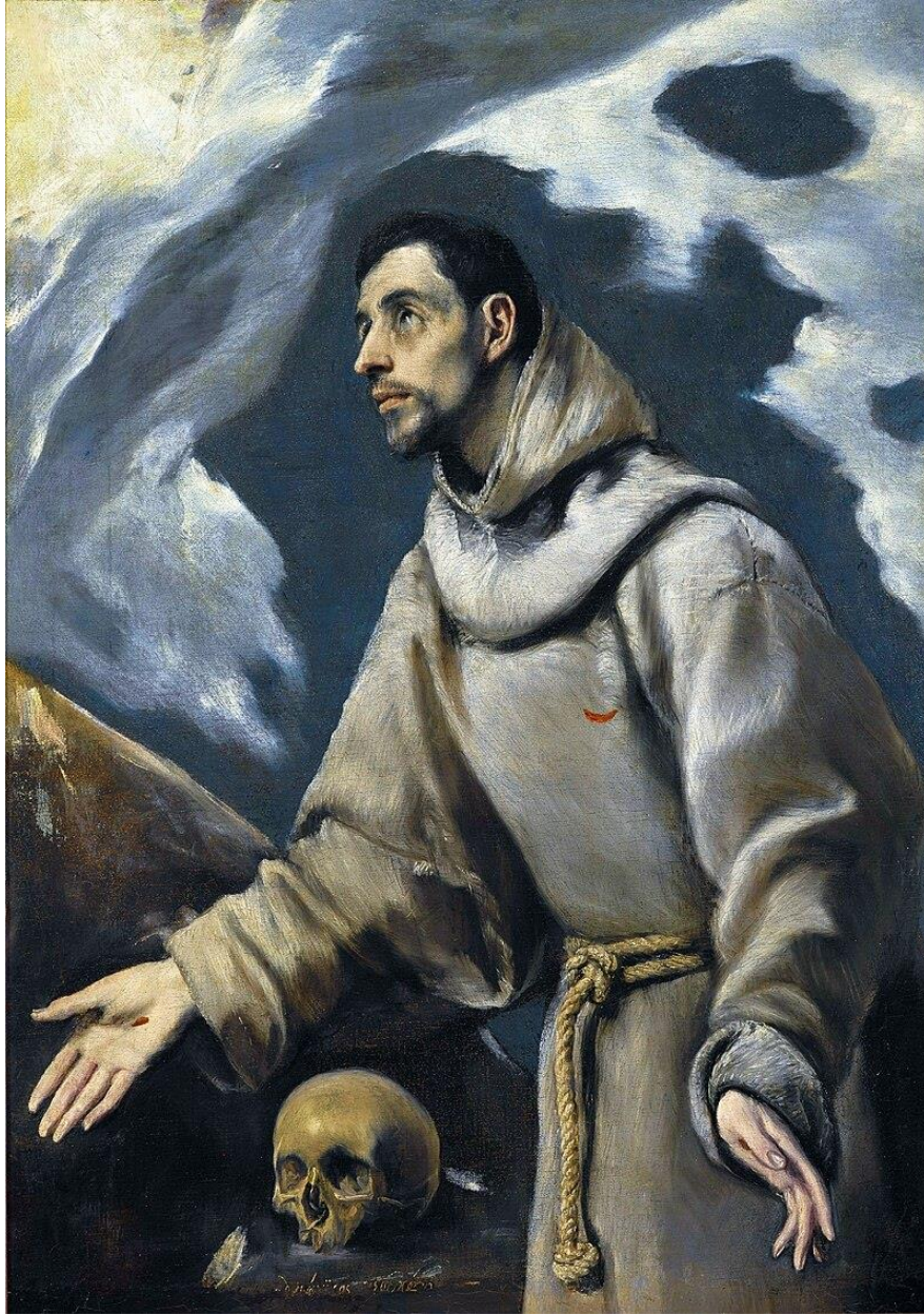
The Ecstasy of St. Francis of Assisi Attributed to El Greco c. 1580