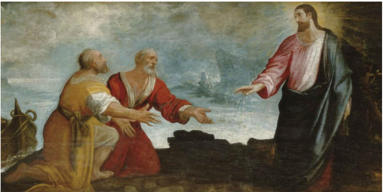
The Calling of St. Peter and St. Andrew by Juan de las Roelas, c.1610