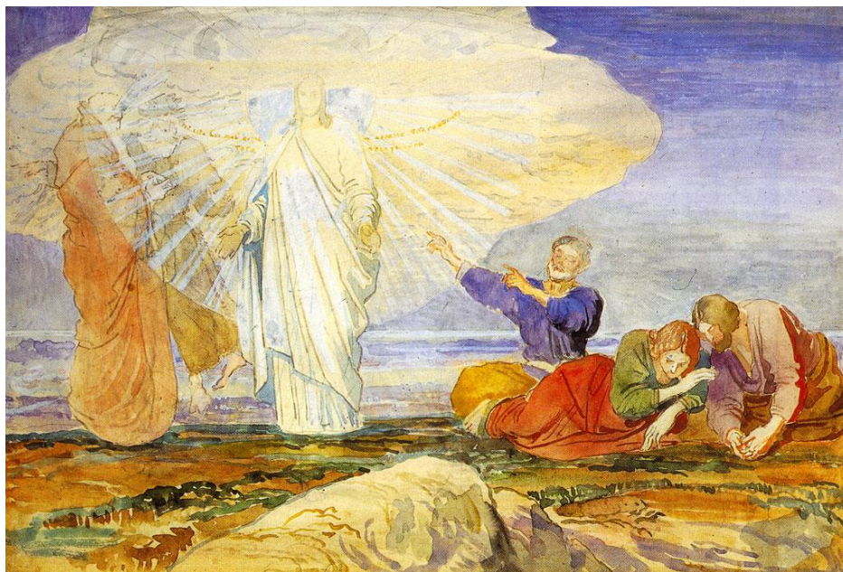
Transfiguration by Alexandr Ivanov, 1824

5pm Saturday Said Holy Eucharist, Rite II Followed by Coffee Hour the first Saturday of the month