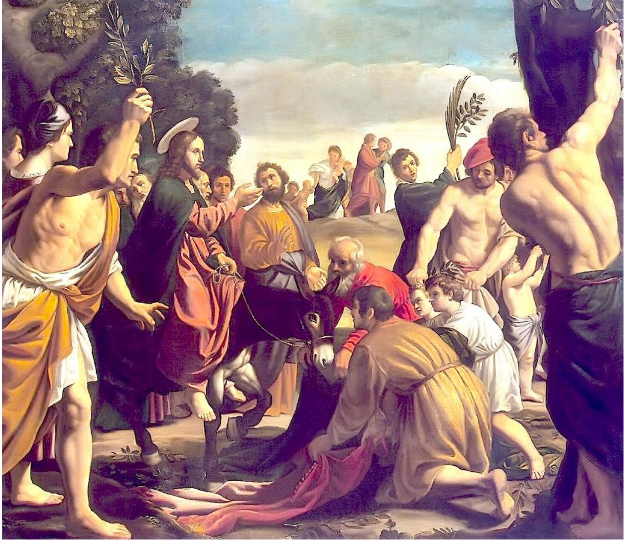
Entry into Jerusalem by Alessandro Turchi (1578 –1649)